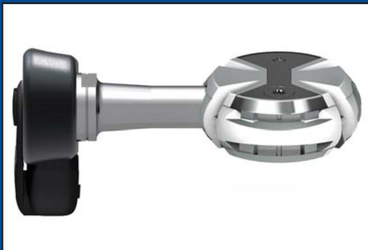
Vector's battery pack fits a wide variety of cranks.