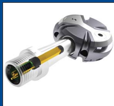
Vector's sensors and electronics are entirely enclosed and sealed within the pedal spindle.