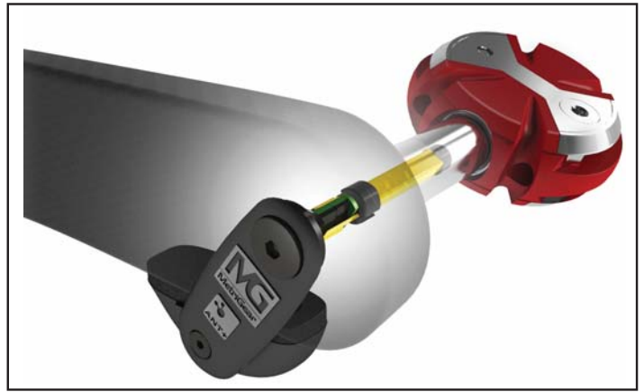
Vector's sensor system captures half a million samples per second.